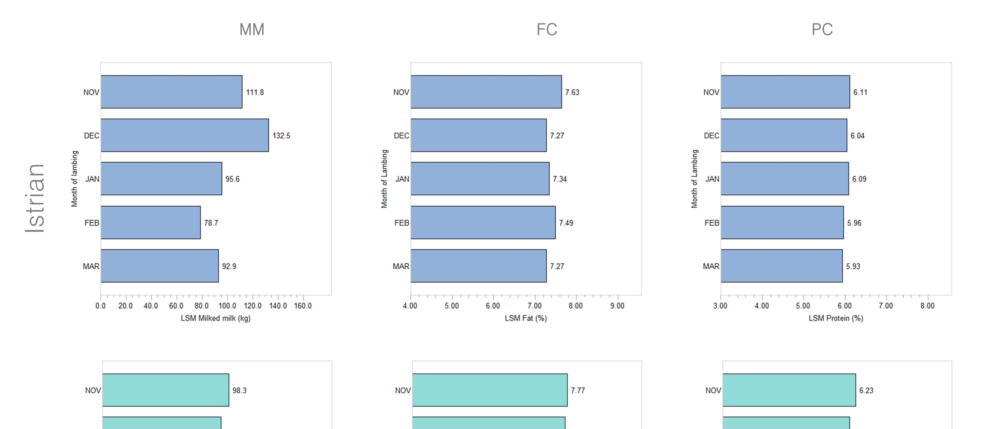
Table 2. LSM \pm s.e of MM, FC, and PC in Istrian and Pag sheep by year of lambing